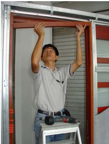
11. Cover up track with the other top door jamb