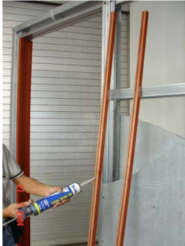
1. Apply bonding agent to groove portion of the side door jamb