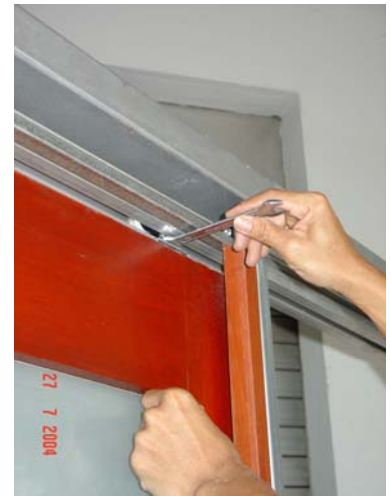
10. Turn the bolt head to adjust gap below door panel and its verticality