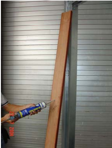
3. Apply bonding agent to back of front jamb