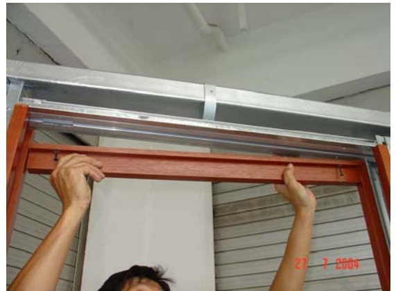
5. Placed top door jamb against aluminium track