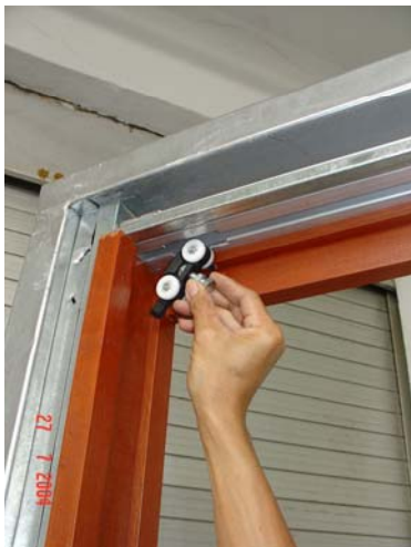
7. Slot in Rollers thru the track opening at the front