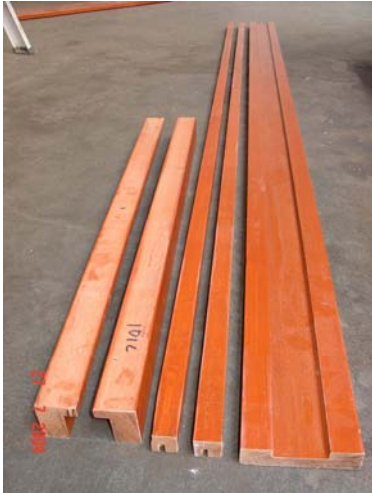
Left 2 pcs – Top door jamb. Center 2 pcs – Side door jamb Right pc – Front door jamb