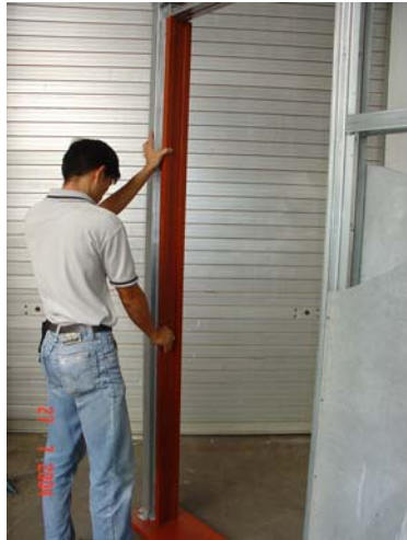
4. Press and bond front jamb to existing wall with additional fasteners if necessary.