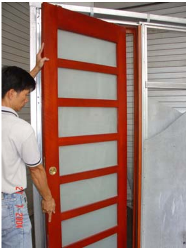
9. Hang door panel with the steel hanging bracket catching the Roller bolt