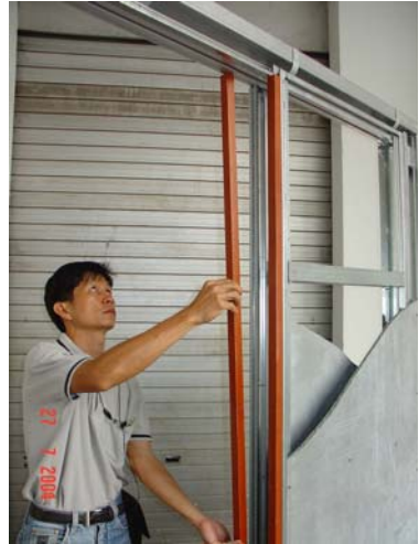
2. Push groove to grip the wing portion of the steel frame front studs