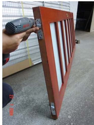
8. Mount steel hanging brackets to door panel

CAUTION : Synchronize bracket bolt-hole and door panel mounting direction correctly to avoid obstruction from top door jamb. Alternatively, hang the door panel first then mount the top door jambs later.