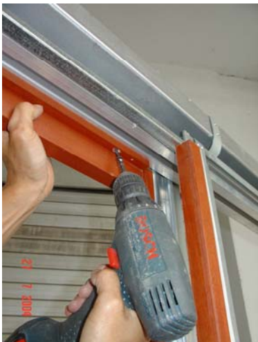
6. Use screws or bonding agent to fix top door jamb to track